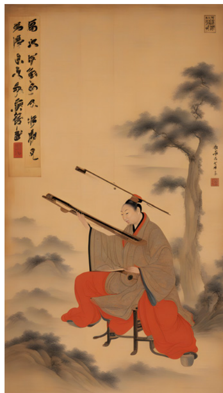
Adachi Tomomi, AI-generated image of Spirisapientlyra , 2024