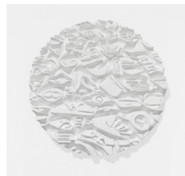
Adachi Tomomi, hieroglyph , 2025, 3D Printing (FDM System ABS), spray paint, \phi 20 cm

In reality, we do not fully understand even human history. Adachi suggests that instruments and characters created by generative AI might have been comprehensible to our ancestors, but modern humans may lack that knowledge. When the singularity arrives, a point where AI surpasses human intelligence, there is no guarantee that we will recognize that moment. It is akin to a future left in the past, and perhaps AI is pointing to these instruments from the history of the future.