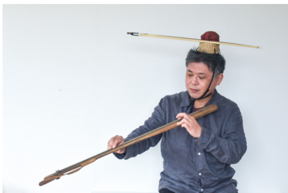
Adachi Tomomi, Spirisapientlyra , 2024, String part: wood, 140 x 9.5 x 4.5 cm Bow: fabric, wood, bamboo and prastic , 72 x 19 x 16.5 cm